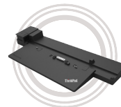
ThinkPad® Performance Dock PN: 40A50230XX