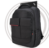
ThinkPad® Professional Backpack - Up to 15.6" PN: 4X40E77324